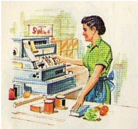
teller or cashier